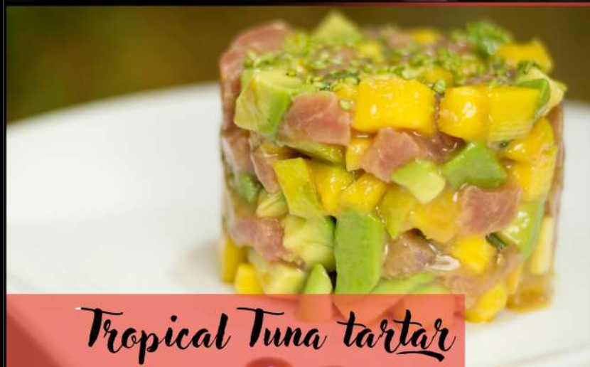
Tropical Tuna tartar